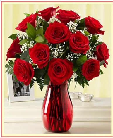
Mother's Day Prayer

Loving God, you wrap your arms around your people and show your everlasting love in the same way a mother loves her children. We are grateful for the love you have taught us through the mothers in our lives: our own mother who brought us into this world, the mothers of friends who have welcomed us into their homes and families, our grandmothers who took time for us, and the mothers who have helped us even though we were not their children. Bless all the mothers of this world today. May they know the fullness of love they have shared and be blessed every day of their lives. Amen